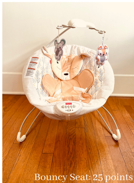
Bouncy Seat: 25 points