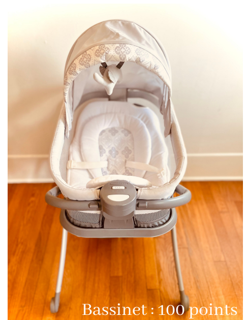
Bassinet : 100 points