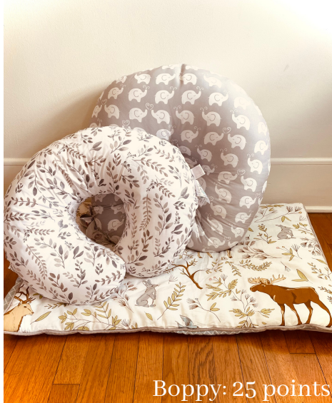
Boppy: 25 points

You can redeem your points at any time! Just give us a call at 337-331-0602 to schedule your shopping session Mondays-Thursdays 9am-5pm. Unsure how many points you have? Call to find out how many points you've earned. If something catches your eye that you want to work towards, let us know! We can help you make a plan and give insider tips for earning extra points! Check out some of the hot items in our boutique right now: